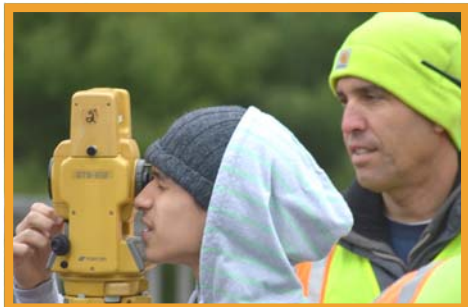
*Actual equipment and exhibits are subject to change based upon availability and vendor participation.

Pre-register NOW with estimated number of students to reserve your spots!!